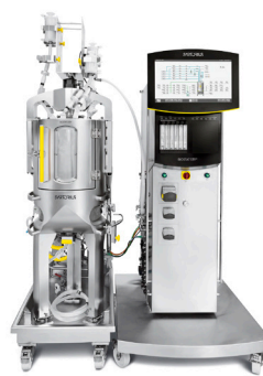
Biostat STR® 50