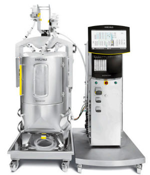
Biostat STR® 200