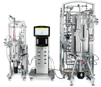
Biostat® D-DCU 10 - 200 L

← Also scalable to multi-use technologies →