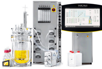
Biostat® B-DCU with Univessel® Glass 1 - 10 L