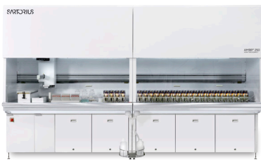
Ambr® 250 High Throughput

BioPAT® Process Insights is a standalone, on-premise software application. Each license permits up to 10 concurrent seats. A renewal license (not included) is required after 1 year to continue usage of the software. Please check the technical specification for minimum computer hardware and software requirements.