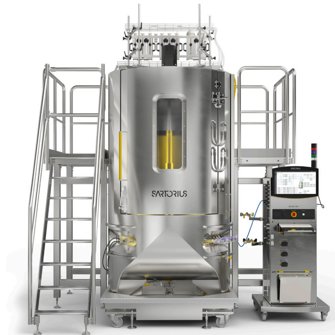
Biostat STR® 2000