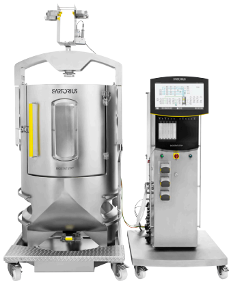
Biostat STR® 500

← Also scalable to multi-use technologies →