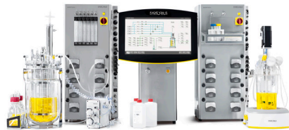
Biostat® B Univessel® SU 2L