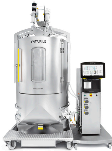
Biostat STR® 1000