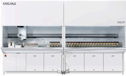
Ambr® 250 High Throughput